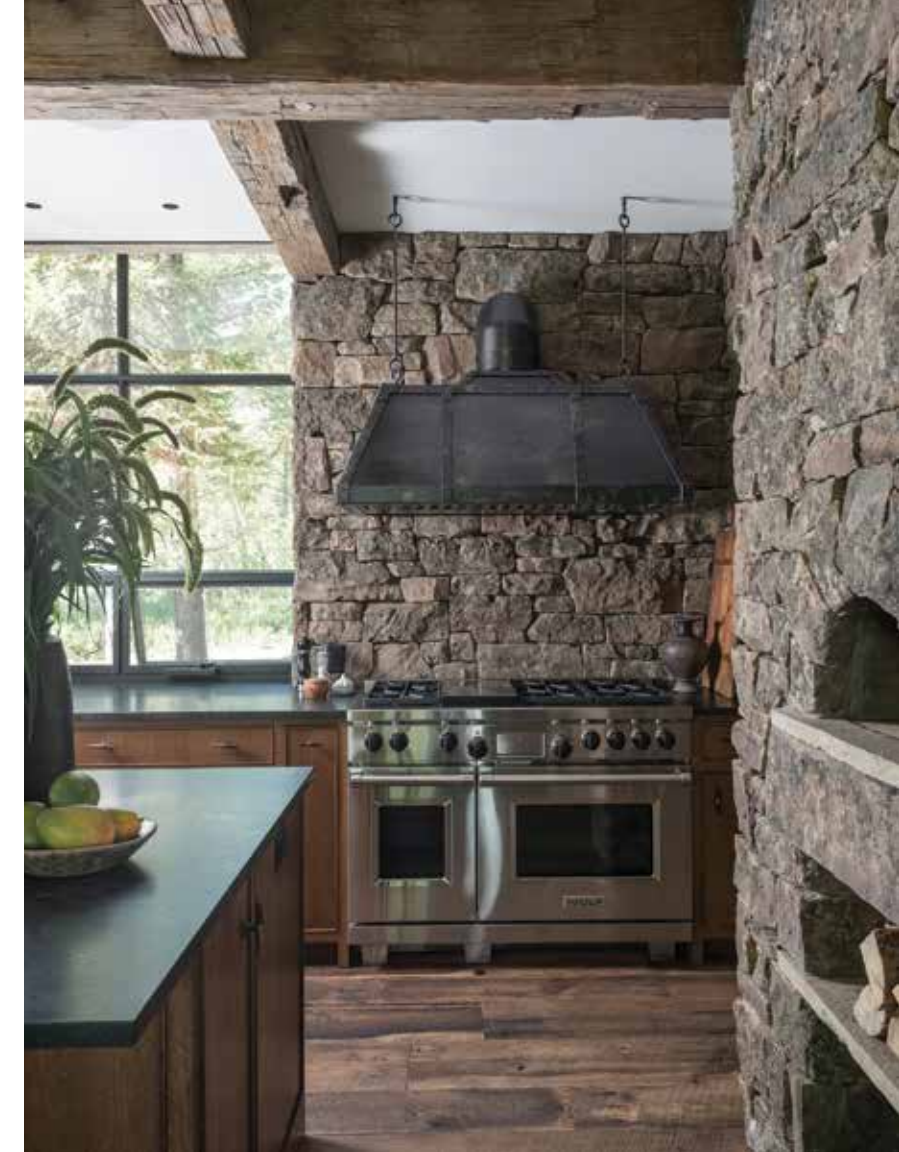
Opposite page: A partial wall of Montana moss rock defines the great room at the center of the home. The broad windows frame views of the surrounding mountains. This page, from top: The kitchen combines reclaimed oak floors, distressed white oak cabinetry, honed granite countertops, and a forged iron hood by Heart Four Ironworks. The wood-fired pizza oven keeps everyone clustered around the kitchen island on winter nights. | In the dining area, lighting by John Pomp illuminates a table and chairs from Michael Berman Limited.

"This is a reinterpreted New England antique in Wyoming, with cozy, warm, and interesting spaces," says Bertelli.